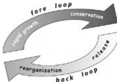
Figure 1. Adaptive Cycle Model

Another framework is the adaptive cycle, used for describing properties and dynamic in internal system link (Folke 2006; Walker & Salt 2006). In different time and space scale, the system changes in four phases: rapid growth, conservation, release and reorganization (Figure 1) (Walker & Salt 2012; Gunderson & Holling 2002).